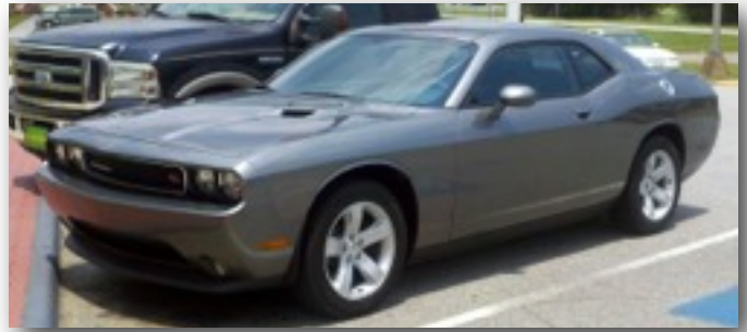
Steve Weigandt's Dodge Challenger

Take I-75 to exit 136. Go to the Ramada Inn on the frontage road on the southbound side of the interstate.