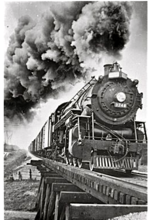
HISTORICAL PHOTO OF THE MONTH GTW 3748 NEAR MUSKEGON