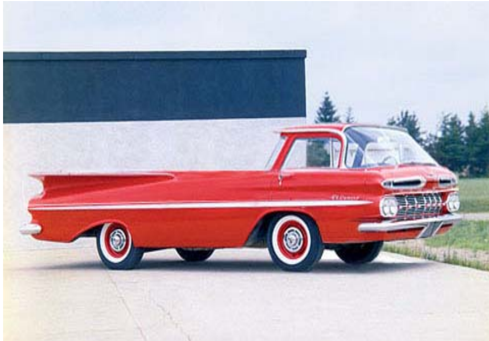
CONCEPT CORVANS FOUND ON CORVAIRCENTER.COM