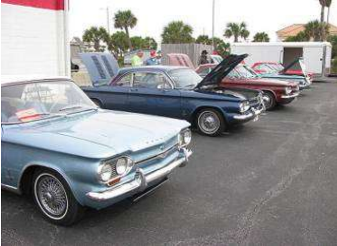
The above picture must be of some early models at our car show two years ago. We did not have this many early models last year.