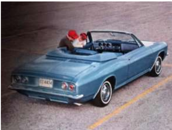
Car Experts of all ages find it fascinating CORVAIRE by Chevrolet