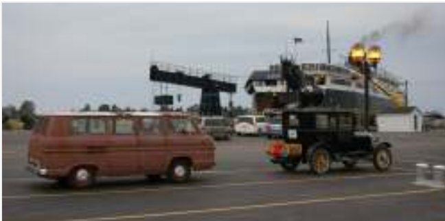
Only mishap was the speedometer quit working.