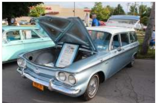
Other members attended as well