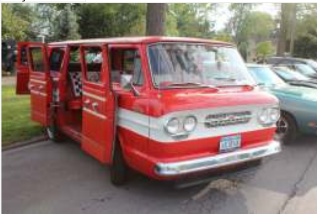
In August, our club meeting was held at the Lockport Cruise Night, on Van Night! Three Corvair Vans were there!