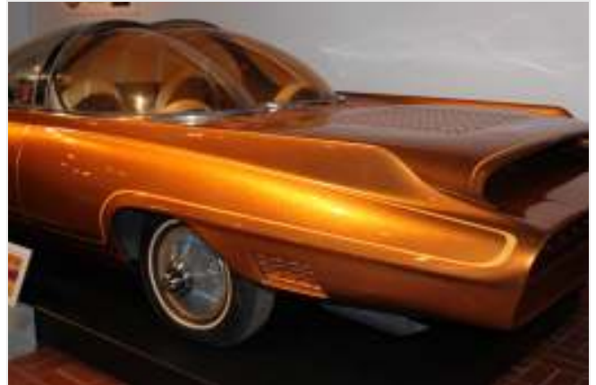
Car originally looked like this: It has been re-created a couple times