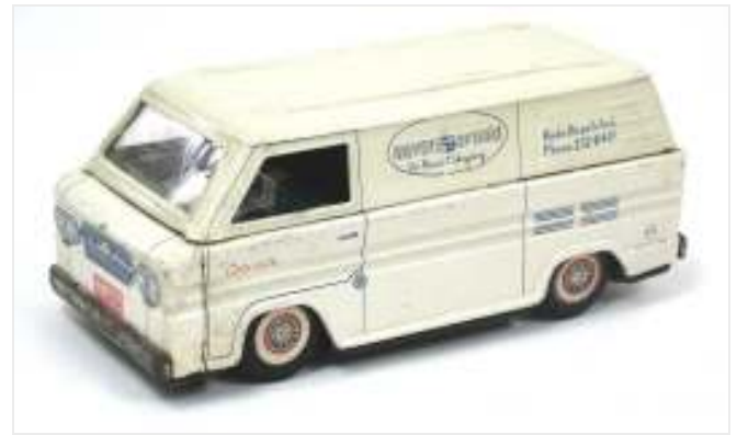
Very Rare Meyers KTS Tin Toy Van

Remember! Any NFCC meeting you are welcome to bring in any memorabilia, pictures, toys or other cool stuff to share with the rest of us. Think about ideas and activities for 2014!