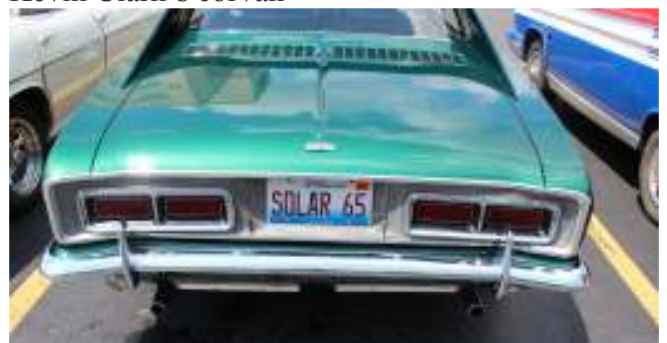
A Solar Cavalier