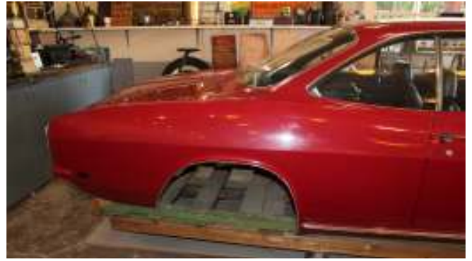
These shots were taken at the Gilmore Museum. There was an outdoor "unveiling" of this artifact on Saturday. I took these Friday. Owned by the CPF