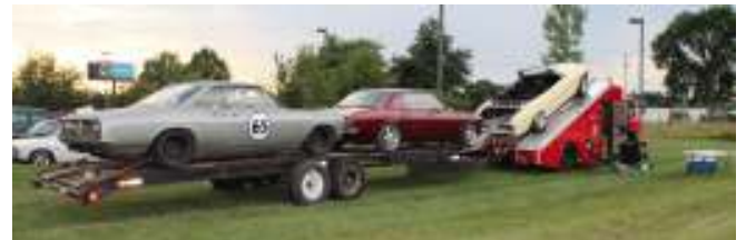
I want this transporter to get my Vairs around!