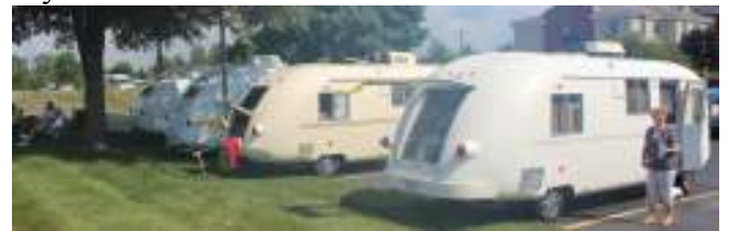
The Whales have landed!