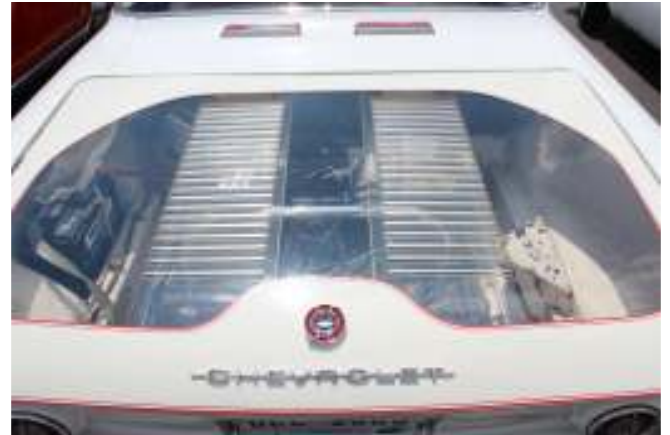
Plexiglass motor lid.