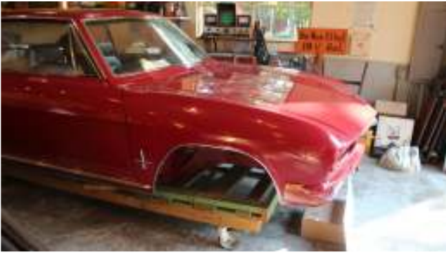
Body in red, a 69 Corvair body built by Fisher, but never sold to Chevrolet. No serial number, but built later than the elusive #6000