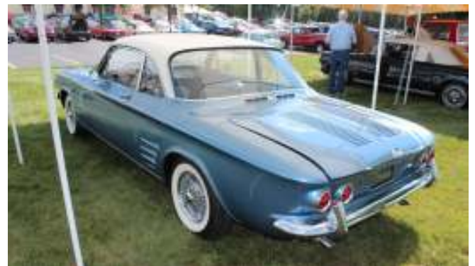
The Super Monza was there! Built originally for Lynn Mitchell, now owned by the Corvair Preservation Foundation and on display at the Ypsilanti Heritage Museum. Brought to the convention for display.