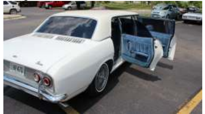
Stylish Corvair Limo