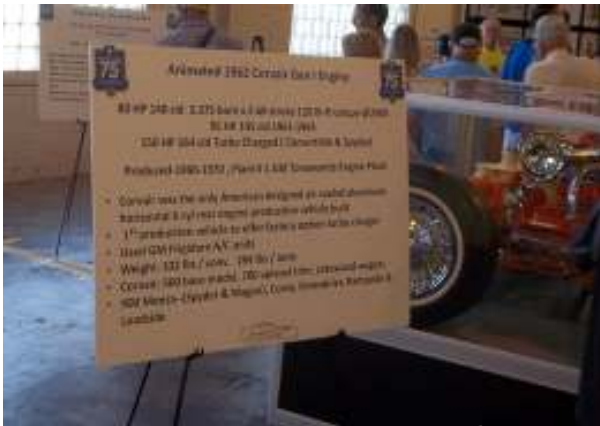
GM Tonawanda Powertrain plant 75 th anniversary.