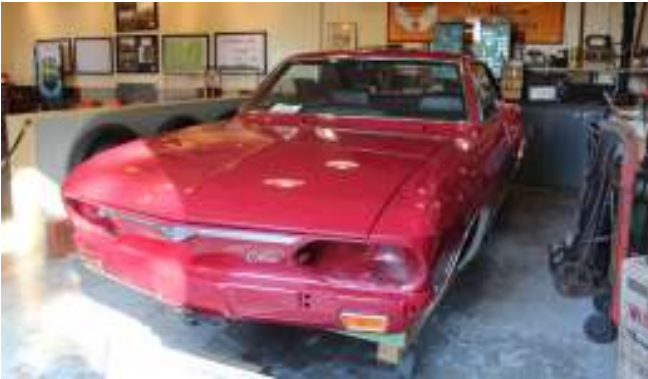
I want it!