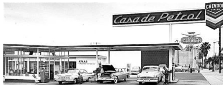
Gasohol in the 30s & old tyme gas stations